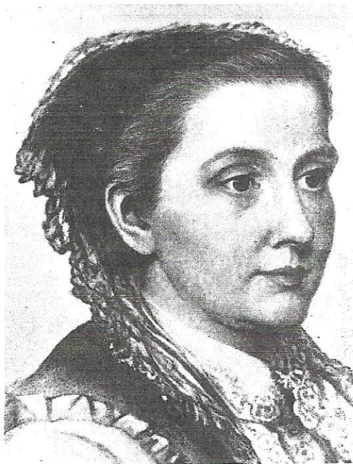
Schlesinger Library, Radcliffe College.

DID YOU KNOW ?? that the 1st MOTHERS DAY was started by a Unitarian woman as a day for women all over the world to work for PEACE ?